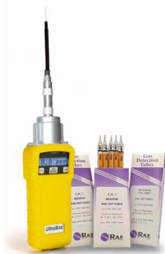
Figure 1. MiniRAE 2000 PID (left) and UltraRAE (right).

The standard 10.6 eV lamp is preferred because it lasts longer than the 11.7 eV lamp, and the sensitivity is about the same.