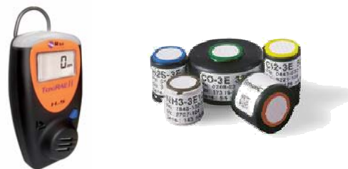
Figure 3. ToxiRAE II single gas-monitor with electrochemical PH 3 sensor.