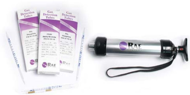
Figure 2. Gas detection tubes for MeBr and PH 3 with hand pump.